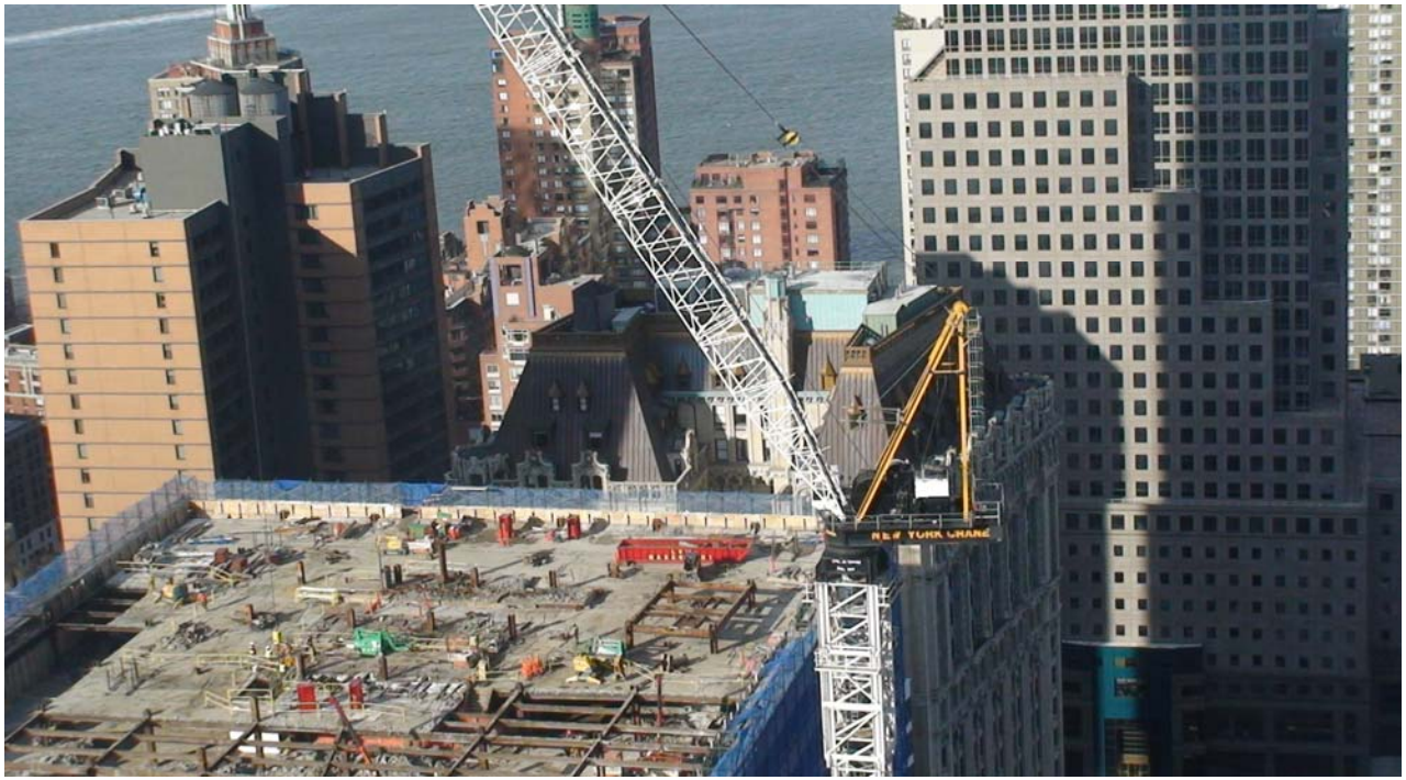
Tower Crane – a common fixture at any major construction site. They often rise hundreds of feet into the air, and can reach out just as far. The construction crew uses the tower crane to lift steel, concrete, large tools like acetylene torches and generators, and a wide variety of other building materials. On the 130 Liberty Street project the tower crane is used to lower large containers from the working deck to the ground. (As of January 29, 2010)