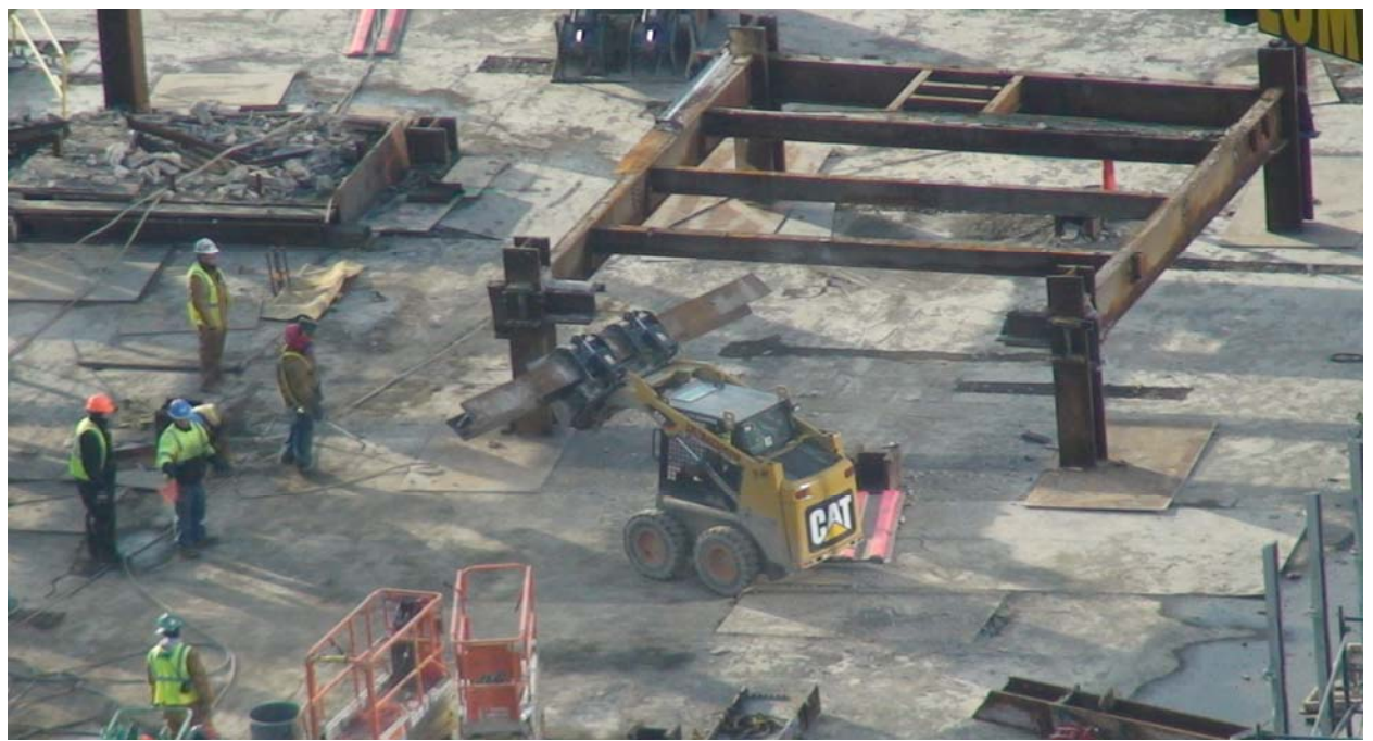
Skid Steer Loader - used to move building materials such as steel on the deck of 130 Liberty Street. Their small size and maneuverability allows them to operate in tight spaces.