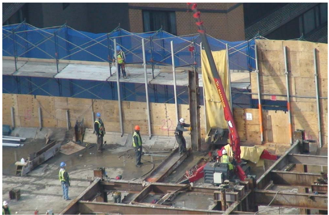
Spyder Crane – the small size and maneuverability of these mini-cranes allow them to be used where other cranes cannot go. On the 130 Liberty Street project the mini-cranes are used to access the interior of the building, hold steel in place, and lower steel onto the deck.