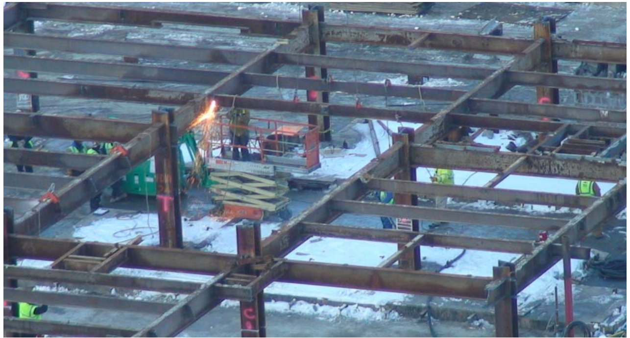
Scissor Lift – used at 130 Liberty Street to hoist welders up to the steel beams.